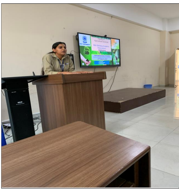
Students delivering the Speech on Forest Importance