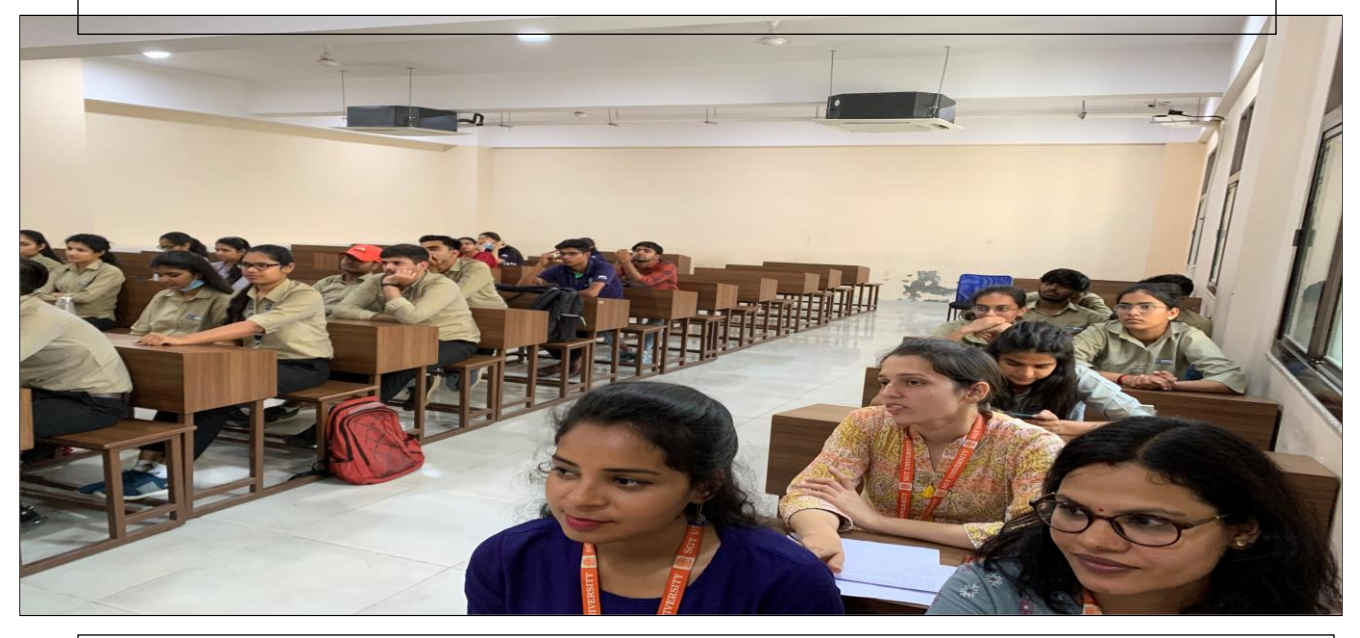
Faculty coordinator evaluating the performance of performance of participant